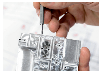
High precision machined parts

From the prototype, through the preproduction run, up to the serial product – PWB manufactures customized subassemblies as well as turned and milled precision parts out of aluminum or stainless steel. Our services range from engineering, procurement, manufacturing, measuring and cleaning up to assembly and logistics.