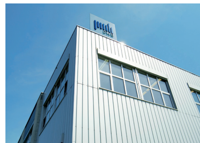
Site in Altstätten and Pfäffikon (ZH)