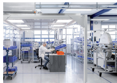
Assembly of subassemblies and modules

Tiefenackerstrasse 50, 9450 Altstätten Barzloostrasse 1, 8330 Pfäffikon (ZH) www.pwb.ch, info@pwb.ch