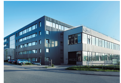
Head office in Pfäffikon (Canton of Zurich, Switzerland)