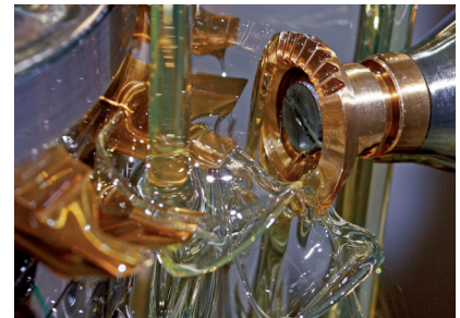
In-house production and assembly

Development, manufacture and sales of standard and custom designs for gear components, sprockets, worm and bevel gears, custom gears and other drive system components.