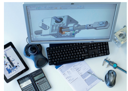
A well thought-out drive solution for every situation