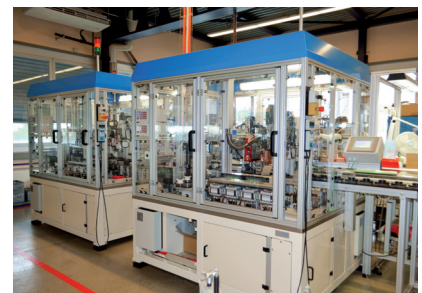
In-house production in Switzerland