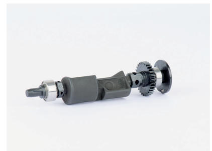
Customised ball bearing solutions in automotive industry