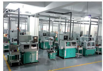
In-house production in China