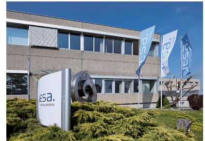
Headquarters in Villars-sur-Glâne, Switzerland

Rte du Petit-Moncor 9, 1752 Villars-sur-Glâne www.jesa.com, info@jesa.com