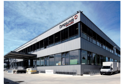
Head office in Pfäffikon (Canton of Zurich, Switzerland)