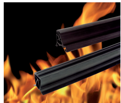
Product examples – Rollerhead sheets and profiles